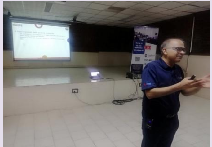
Workshop on “Cyber Security and Seminar on “AI&ML and their Impact on Computer Sciences”