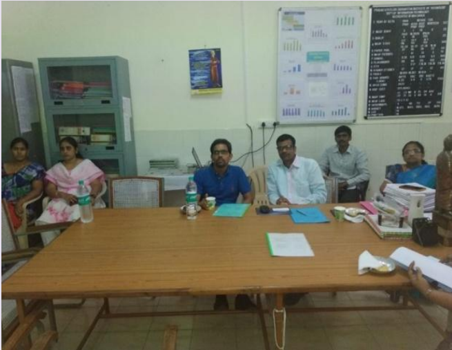
BOS Meeting on 01.06.2019