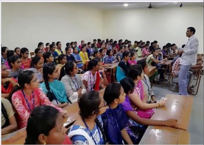
Induction program to II, III and IV B.Tech IT students