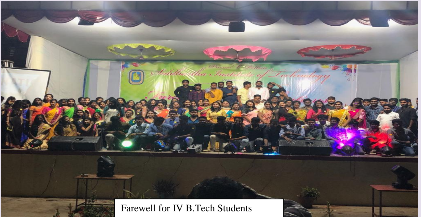
Farewell for IV B.Tech Students