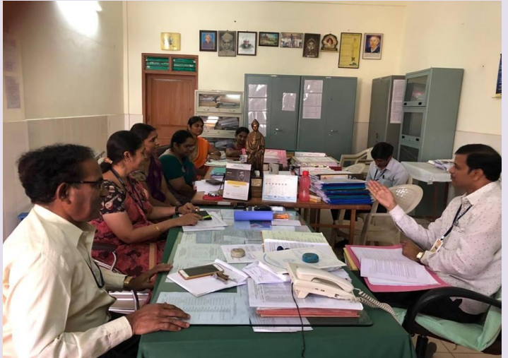
Program Assessment Committee (PAC) meeting on 21.02.2019